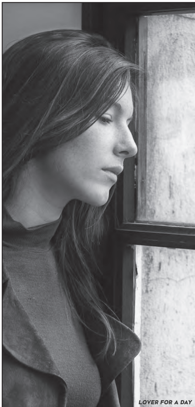
LOVER FOR A DAY

SATURDAY, JULY 14 – 8:00 PM SUNDAY, JULY 15 – 6:30 PM