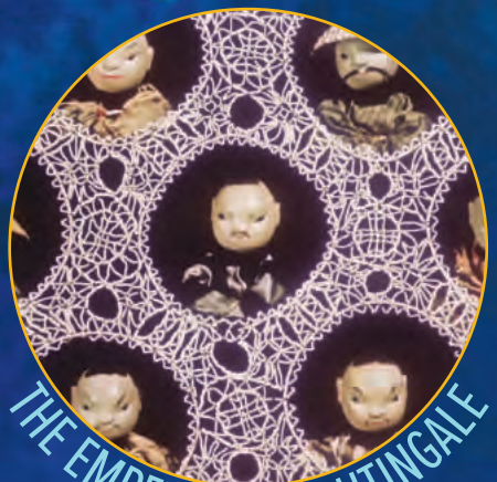
THE EMPEROR'S NIGHTINGALE (CÍSAŘŮV SLAVÍK)

THURSDAY, JULY 19 – 6:30 PM SATURDAY, JULY 21 – 6:30 PM