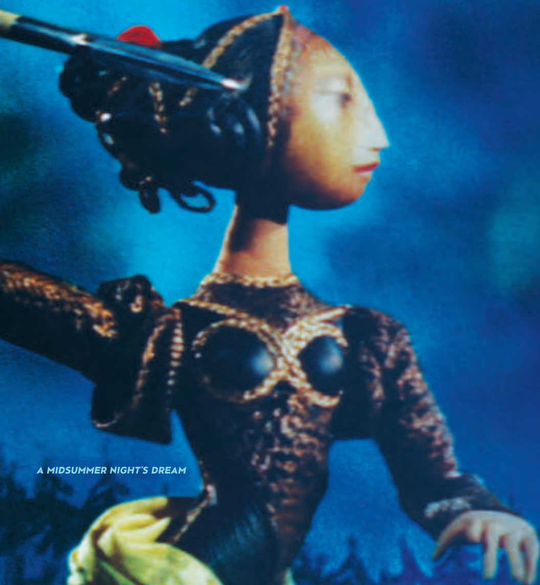
A MIDSUMMER NIGHT'S DREAM