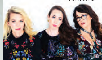
I'm With Her